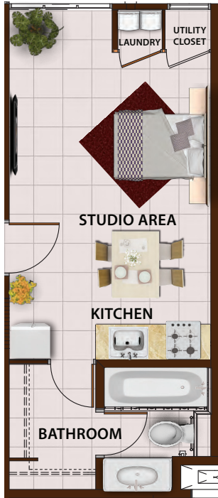
Studio 30m 2 (323 ft 2 )